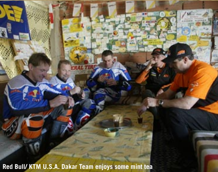
Red Bull/ KTM U.S.A. Dakar Team enjoys some mint tea