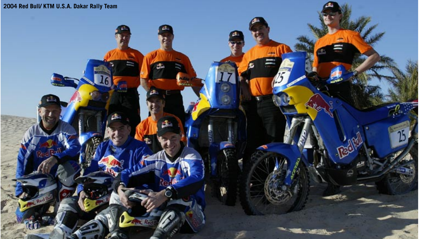
2004 Red Bull/ KTM U.S.A. Dakar Rally Team