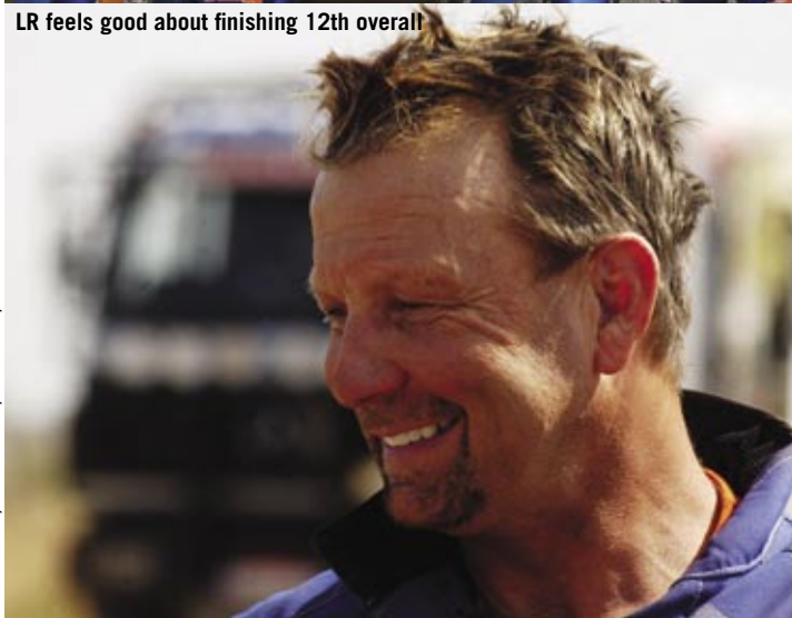
LR feels good about finishing 12th overall