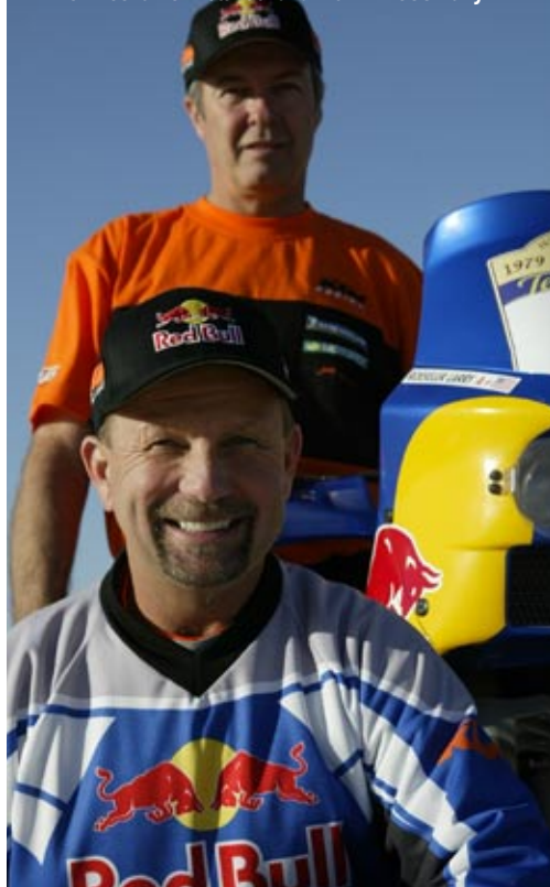
LR awaits for the 37 km trek to the podium