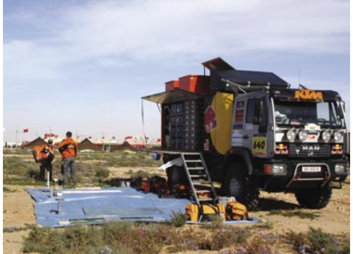
KTM mechanics prepare for a night of wrenching